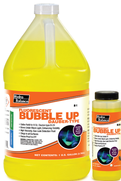
DAUBER INCLUDED (B-24)